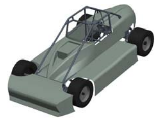
Original USAC Design 2005